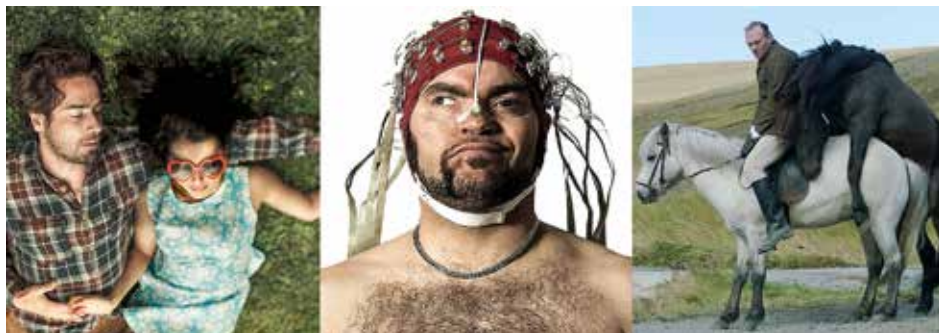
Stills from I am Yours , Knucklebonehead and Of Horses and Men .