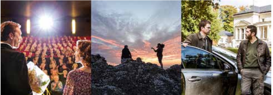
Stills from Sorrow and Joy , Trespassing Bergman and Keeper of Lost Causes .