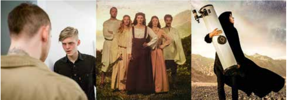
Stills from Ferox , Freak Out and Sepideh .