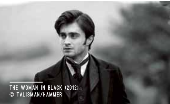
THE WOMAN IN BLACK (2012)