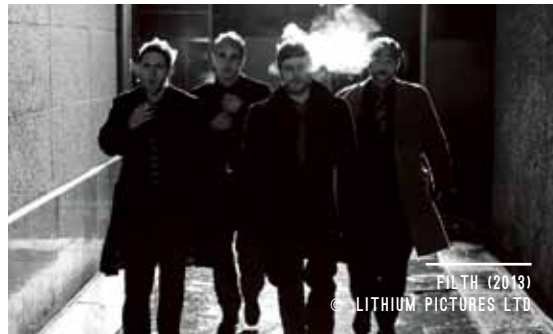
FILTH (2013)