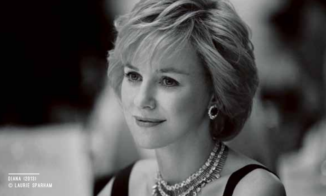
DIANA (2013) © LAURIE SPARHAM