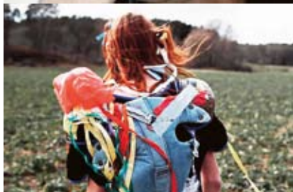
From top to bottom: A Kind of Paradise, The Samurai Case, She Male Snails