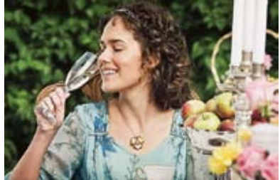
From top to bottom: Colombianos, Karen Blixen Behind Her Mask, Where Once We Walked