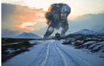
From top to bottom: Mother's Comeback, Savage, The Troll Hunter.