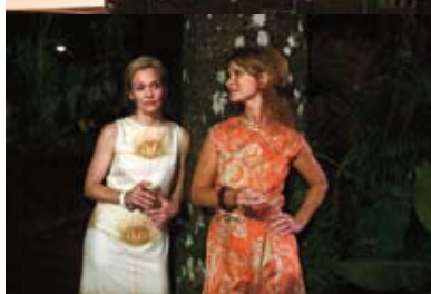
From top to bottom: El Medico – The Cubaton Story, Finding Ali, Limbo.